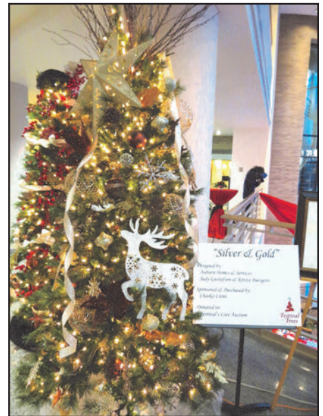
People's Choice Award Winner